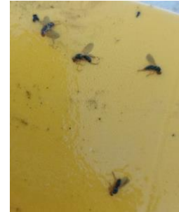
Eriel Strauch - Scout

Second generation carrot rust flies are emerging and have been found in a number of fields. This generation can cause damage and it is important to spray if your field is over threshold. If your field is over the 0.1 rust flies/trap/day threshold Mako, UP-Cyde 2.5 EC, Labamba, Matador 120EC and Silencer 120 EC are registered for control.