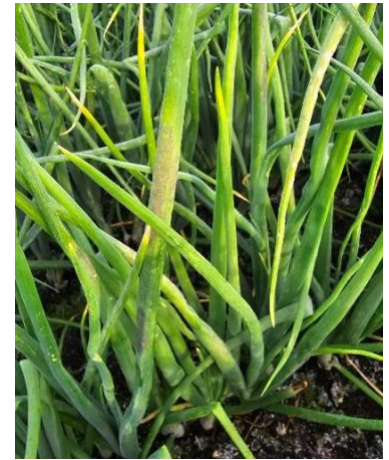
Dom Blass - Scout

Conditions have not been very favourable for onion downy mildew development at the moment. Extending the time between sprays may be an option right now. There are many products registered for control of downy mildew, but our research at the Muck Station has shown that Orondis Ultra (group 40/49), Orondis Gold (group 4/49) and Zampro (group 45/40) are the most effective for controlling this disease. Ridomil Gold MZ (group 4/M3) is no longer being produced, but if you have some it is an effective product as well. These systemic products should protect onions for 10 days. Mancozeb products, such as Manzate Pro-Stick, Dithane Rainshield and Penncozeb 75 DF Raincoat (all group M3), can be effective for controlling downy mildew if applied before infection takes place. Therefore, if you sprayed a mancozeb product for Purple Blotch last week then the onions should be protected for ~7 days. Ridomil Gold MZ also contains mancozeb which may help control both downy mildew and Stemphylium leaf blight. Orondis Ultra should be applied with a non-ionic surfactant. Rotating fungicides is very important.