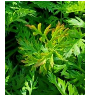
Eriel Strauch - Scout

Aster leafhopper numbers continue to be variable but are high in some fields. Sevin XLR, Admire 240 F, Actara 25WG, Closer and Sivanto Prime are registered if your field is over the 20 leafhoppers/trap or 1 leafhopper/sweep threshold.