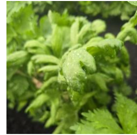
Dom Blass - Scout

Celery leaf curl has been identified but it is relatively uncommon. Switch 62.5 WG and Quadris Flowable are registered for control.