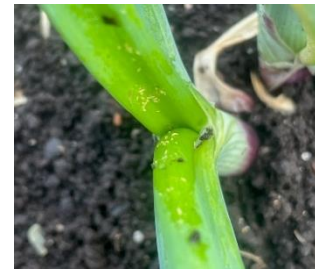
Madison Sirois - Scout

Thrips populations continue to build in many fields. For thrips management, it is important to first apply Movento 240 SC once thrips are present in your field and their population is building. Movento should be sprayed back-to-back no more than 2 weeks apart for resistance management.